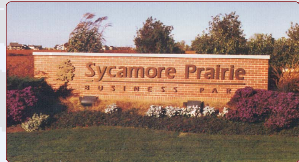
Sycamore Prairie Business Park SYCAMORE, ILLINOIS

Jones Lang LaSalle and IDEAL Industries are pleased to present Sycamore Prairie Business Park, a 200 acre site in Sycamore, Illinois at the intersection of Bethany Road and Peace Road. Located in DeKalb County, the Property is adjacent to the City of DeKalb along the I-88 Illinois Research and development corridor.